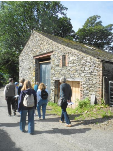
After lunch, we walked round the

The Annual General meeting was held at Millbeck, on the lower slopes of Skiddaw, in glorious sunshine. The officers and committee were re-elected, and we enter our fourth year. The rest of the day was spent in the village hall – which has Arts and Crafts elements - hearing about the woollen industry of the village and the processes which turn fleece into useful products. The Dover family created mills for carding wool, weaving blankets and fulling them. The buildings which remain have been converted into houses.