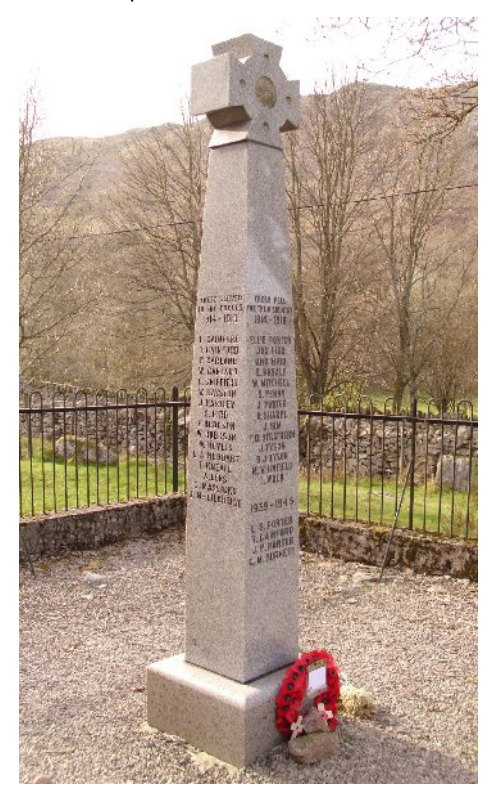
Eskdale's war memorial

Given that this project has been started precisely because there is a severe lack of collated biographical information about most people who served in the forces a century ago, there is a fairly urgent need to help hard-pressed teachers without placing a huge burden on equally hard-pressed museum curators etc. It would therefore probably be a good idea for local history societies around the county to contact their community schools to offer help.