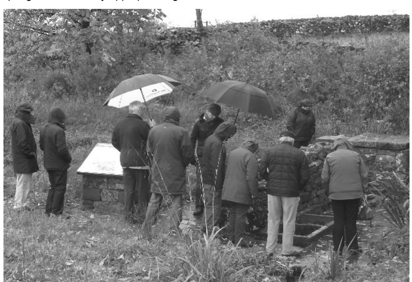
Visit to a restored spring

Although the number attending was not as large as we expected, the 2013 CLHF Convention, in its new venue, was a great success.