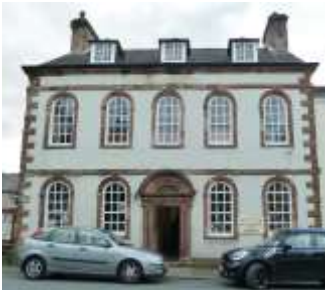
Cartmel Village Institute today